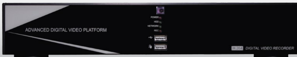
FHD-204(4CH) / FHD-208(8CH) / FHD-216(16CH)